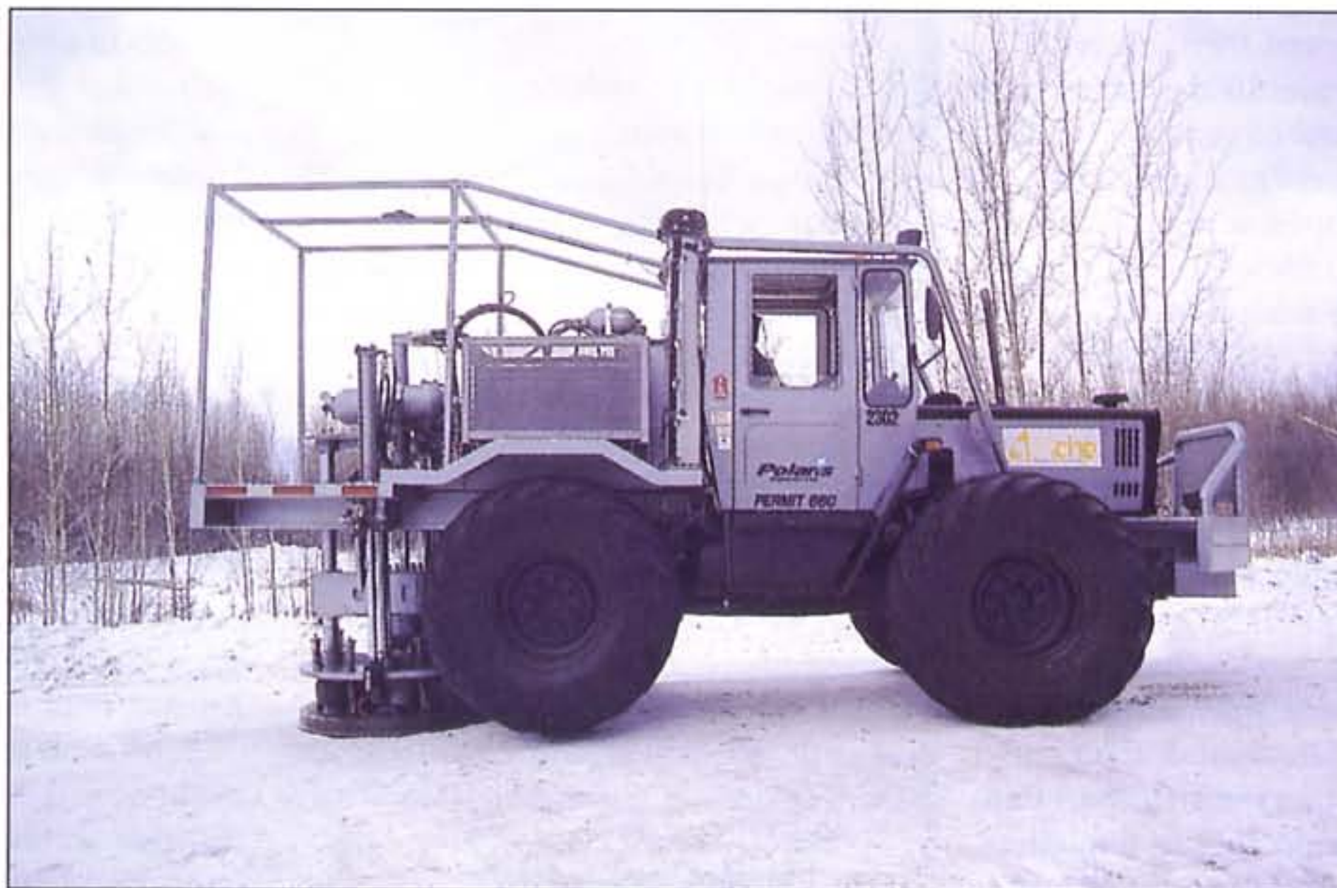
Explorer 860 buggy, created by Apache Corp. and Polaris Explorer Ltd., Calgary, on the job for Apache in the Zama, Alta., area (Fig. 1).

But Apache found it difficult to manage safety levels in production areas. The falling weights, while providing accurate seismic data, could not be used in all areas because of the danger of striking pipelines or