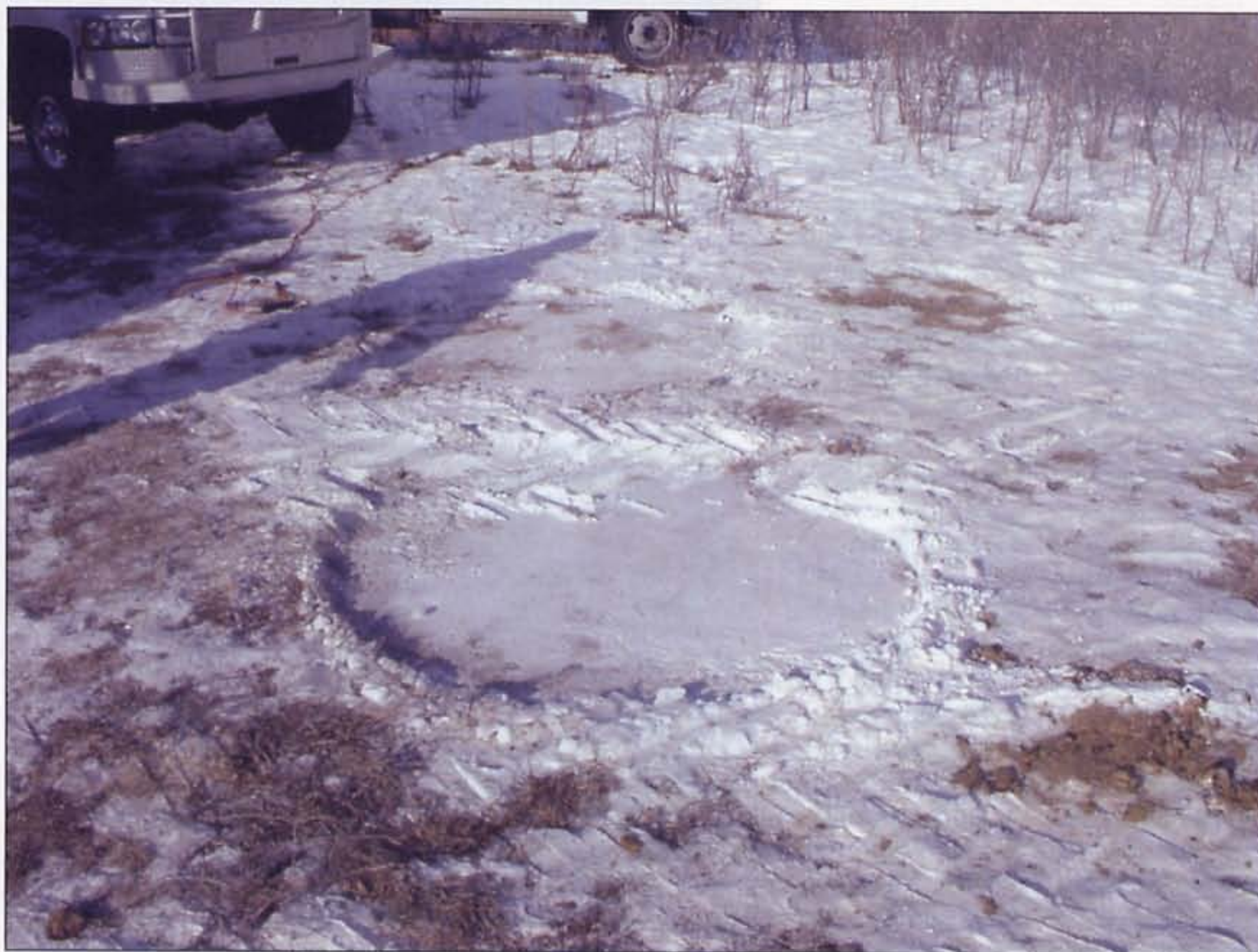
Explorer's base plate leaves an erodable, 54-in. diameter imprint (Fig. 4).

shot points," Monk said. "The unit drives down a line and can shoot every 2 ft if you want it to; it goes thump and we just record more data.